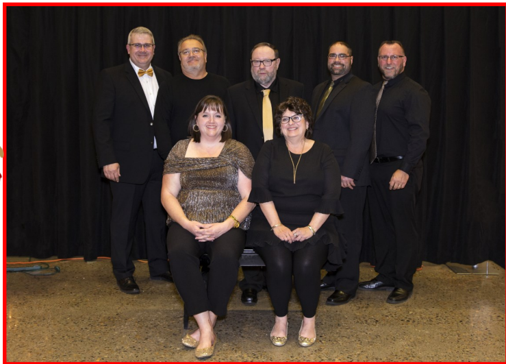
From your Hi-Way 9 Group of Companies' Directors (l-r)